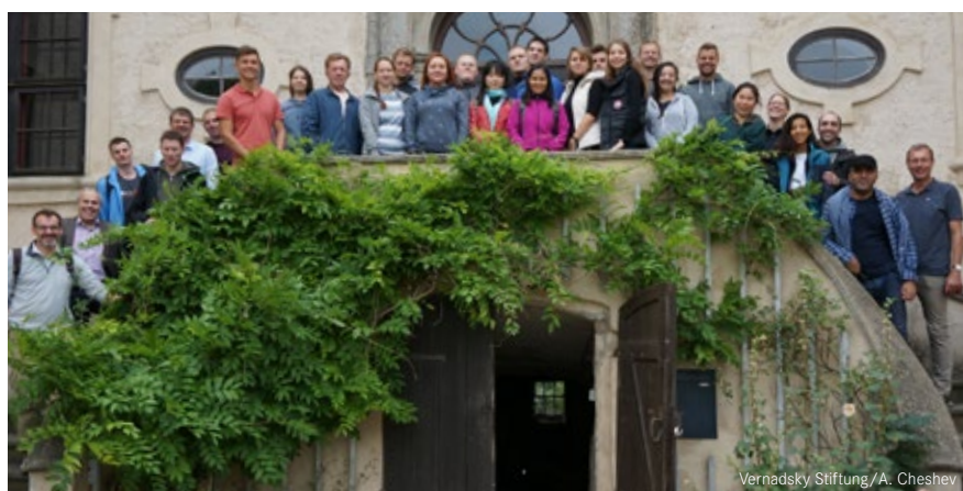
Summer school participants enjoying their stay at Schmarsow Castle.

What impact does global climate change have on regions and landscapes, and how can these effects be measured? In August 2018 – as part of a summer school held at TERENO's Northeastern German Lowland Observatory – 20 young scientists from Germany and Russia gained insights into observing long-term environmental impacts with the help of today's monitoring technology. Led by scientists from the German Research Center for Geosciences GFZ, the University of Potsdam and the Alfred Wegener Institute, participants conducted field studies at TERENO's Demmin field site, and evaluated/modelled ground-based measurements and remote sensing data. An entire day was also devoted to the use of drones and drone-based data processing. Intercultural exchange among the researchers was another focus of the summer school.