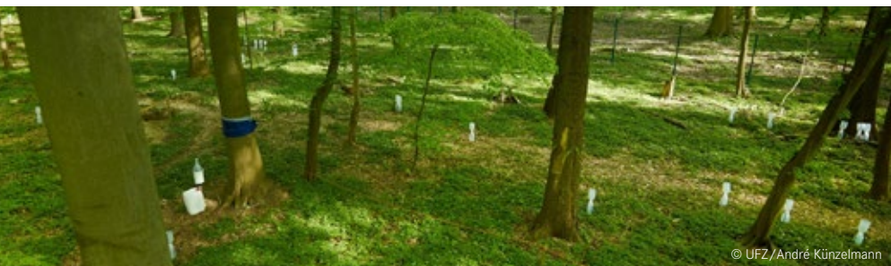
TERENO's Harz/Central German Lowland Observatory will become part of the pan-European eLTER infrastructure.

eLTER RI has been included in ESFRI's Roadmap for Research Infrastructures