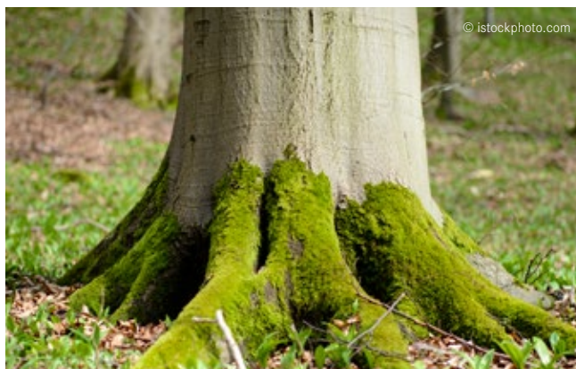
In dry conditions, some trees turn to groundwater sooner than others.

water immediately absorbed by the trees. The lack of such rainfall/uptake events in 2018, and its possible negative impact on the trees in question, is the subject of a current data analysis at GFZ, in which hydrologists and dendrochronologists are joining forces to investigate water availability, water uptake and tree growth.